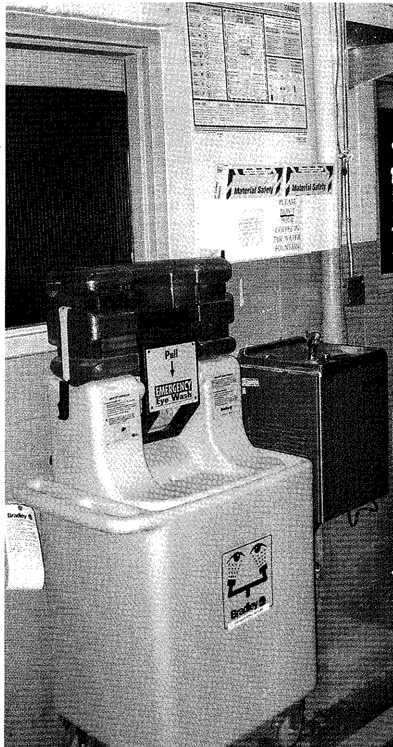
Portable eyewash stations can provide improved response due to their mobility and still provide 15 minutes of continuous flow treatment.

The contractor also provides sustainable inventories to organizations. Rather than conducting the inventories on behalf of the organization, Vicinia will demonstrate to workers