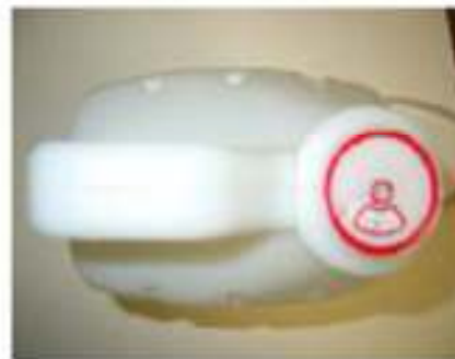
D. PROPER ORIENTATION OF CARTRIDGE IN BOTTLE