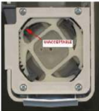
C. TABS SHOULD FULLY RETURN TO STARTING POSITION