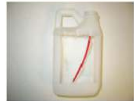
E. CARTRIDGE BENT TOWARD BACK OF BOTTLE