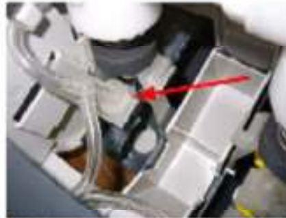
B. REMOVE EDUCTOR OUTLET TO CHECK VACUUM AT EDUCTOR